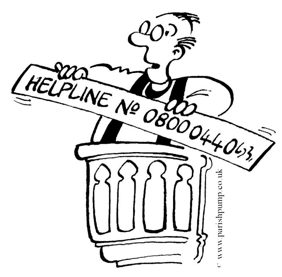
...if you have been affected by any of the issues raised in this sermon...